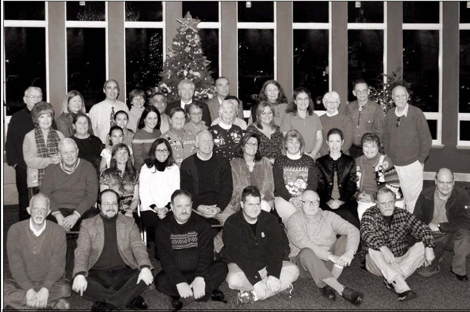
WHS members attending the holiday party