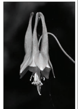
New England Wild Columbine