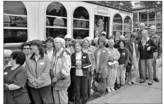
Passengers pose while waiting to board the Trolley