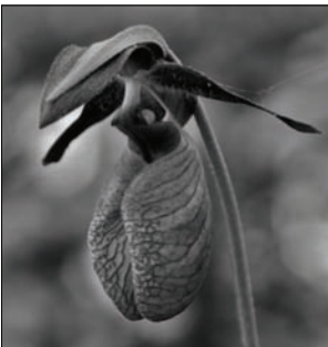
Pink Lady Slipper Orchid