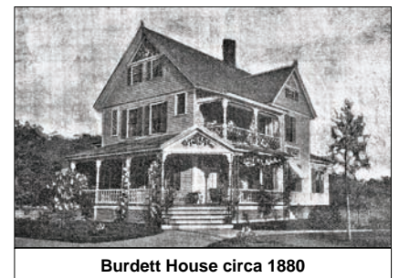
Burdett House circa 1880