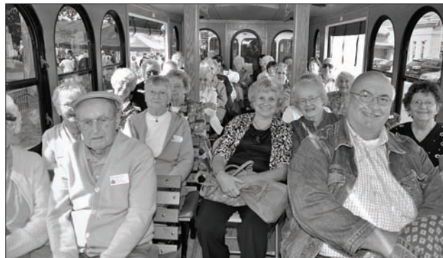
It's a trolley full of happy passengers enjoying the tour!