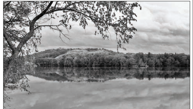
Mt. Towanda mirrored in Horn Pond

A. I would like to see better maintenance of the shoreline areas of Horn Pond, especially the banking along Arlington Road. Native plants along the shore help prevent erosion, provide shade and shelter for wildlife and provide a place for fish to spawn. Trees and native shrubs also provide shelter for wildlife and are a needed windbreak in the winter. Grasses and wildflowers support an abundance of birds and insects. We need to recognize that the Horn Pond conservation area is not a park; it is a conservation area and as such needs to be treated differently than a "grassed park". But at this time there is no funding for conservation areas.